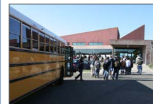
Students arriving at Bodega Marine Laboratory for the CAMEOS symposium.