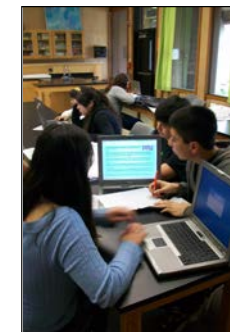
CAMEOS students preparing to present their findings to peers.

• Student practice communication skills and their understanding of scientific concepts through research presentations.