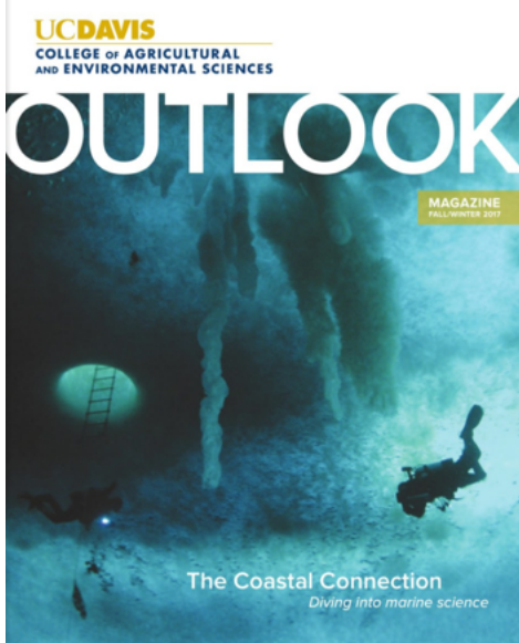
Photo: Outlook Cover

The Bodega Marine Laboratory and CMSI are featured in the newest edition of the UC Davis College of Agricultural Science "Outlook" magazine. Read it here .